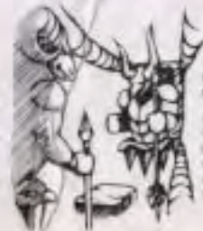
KUMBULO & AMBLELER

This class of Plant Castle attacks by throwing the bones in its two skulls from one to the other. As if that wasn't bad enough, it also can launch deadly projectiles from its mouth.