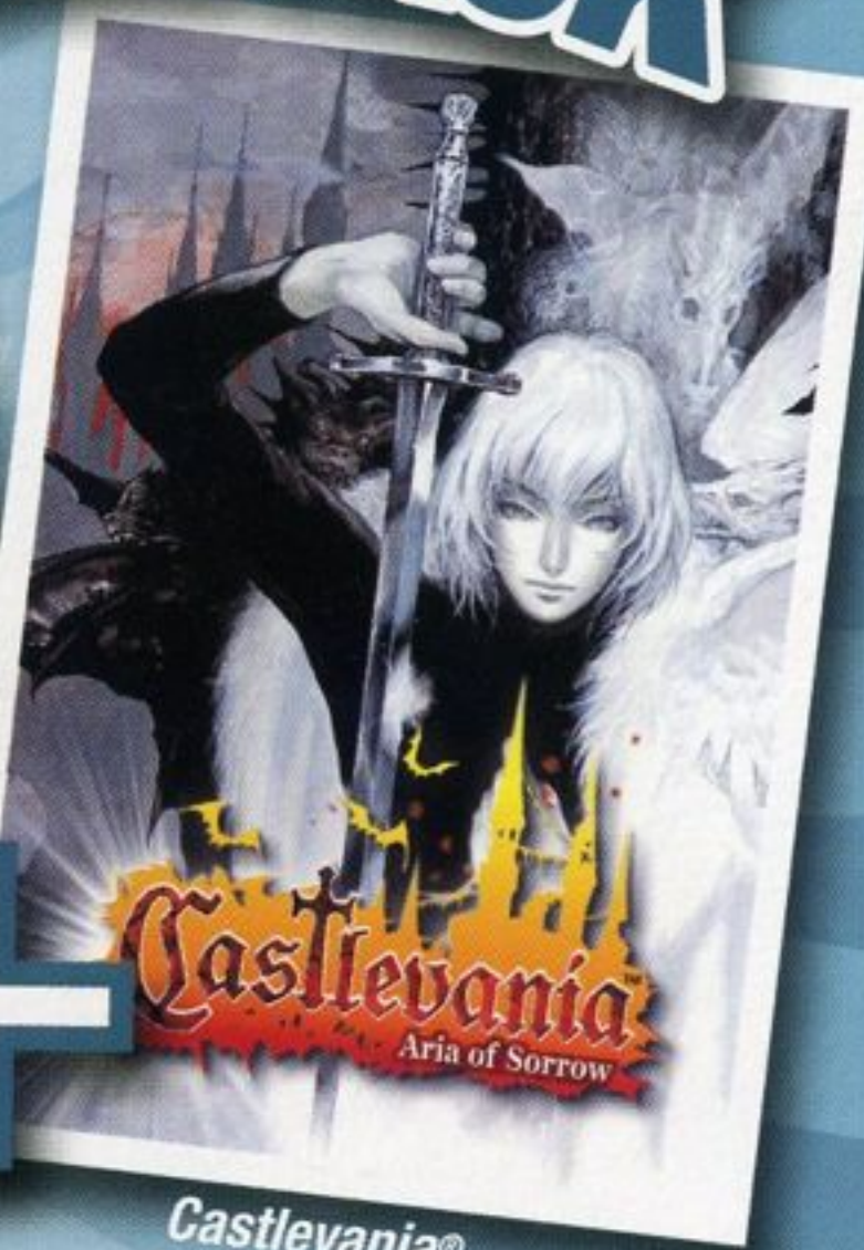
Castlevania® Aria of Sorrow™